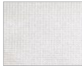
Open Weave Fabric

Our unequaled capacity allows us to produce jobs quickly without compromising quality.