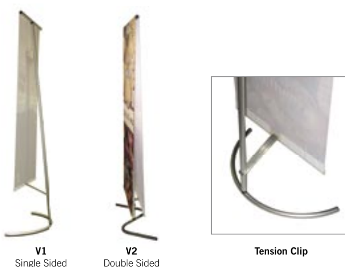
V1 Single Sided

V1 and V2 stands are made from strong 1" anodized aluminum tubing and come with a Hassle Free Guarantee